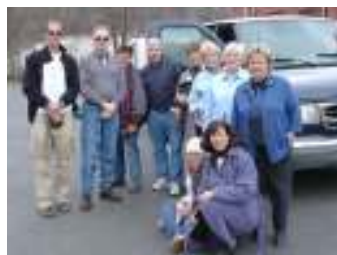
The 2004 TAEI group eagerly awaits their trip.

These intrepid travelers will journey to what some have called “a far corner of the world” for the express purpose of helping to